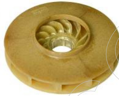
STANDARD CIRCULATOR PUMP

The kinetic energy imparted to impacted debris as water slams into it increases with the square of the water velocity, and this is why a high performance power flushing pump can remove far more debris than any other method of system cleansing.