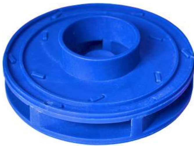
POWER FLUSHING PUMP